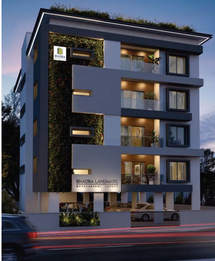
Boutique Elegant Homes, Mahalakshmi Layout, Bengaluru